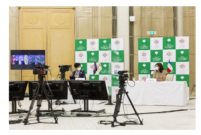
Chatting among participants