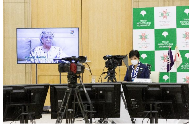
Video messages of Mayor Soham El WALDINI