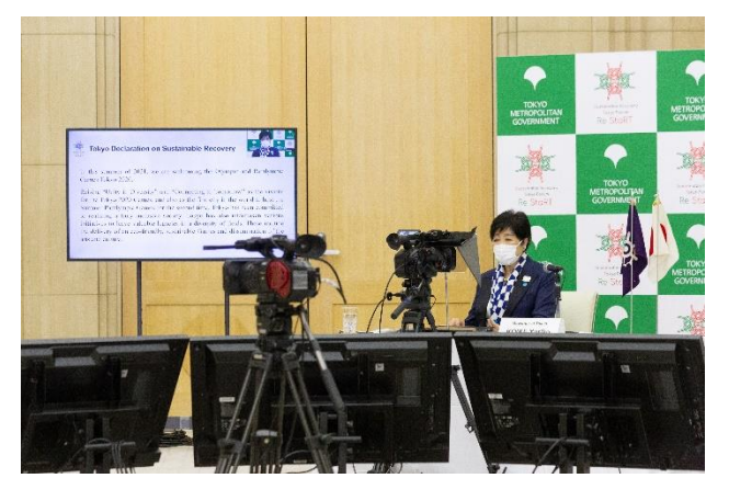
Tokyo Declaration on Sustainable Recovery