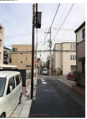
Figure 6 - Aboveground telemeter equipped with rechargeable batteries

Figure 9 - Pole-mounted rechargeable batteries board Figure 8 - Telemeter with combined casing/lead-in pole