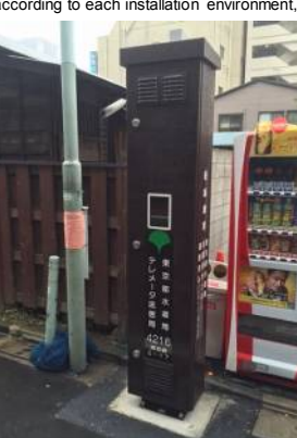
Figure 7 - Thin-type telemeter