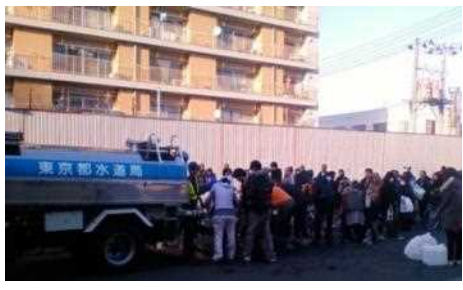
Fig. 4: Emergency water supply activities after the Great East Japan Earthquake

The primary objective of emergency disaster aid activities is obviously to provide relief for disaster victims. Personnel with experience performing such relief work in disaster-stricken areas learn actual crisis response skills through real experience that they could never acquire by training alone. That experience will be put to use in the event that there is ever a disaster in Tokyo.