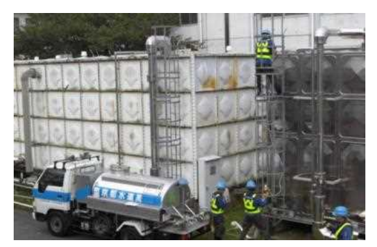
Fig. 7: Emergency drill for supplying water to an emergency hospital