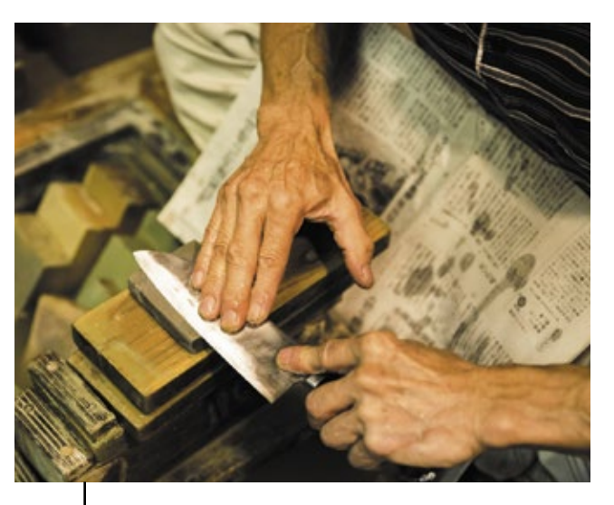
After sharpening the blades by machine, he refines their edges by hand.

And that's the way it is—always a delicate balance between engagement and surrender, or alignment and detachment. Good advice when it comes to sharpening knives, or living in Tokyo, or pretty much everything.