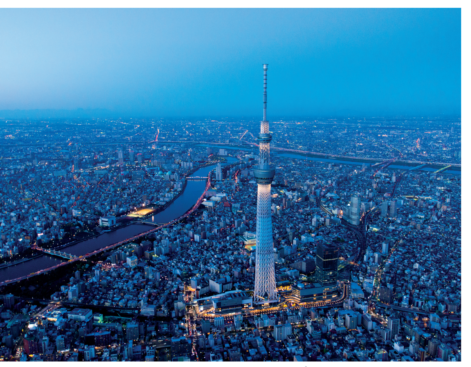
TOKYO SKYTREE and TOKYO SKYTREE TOWN