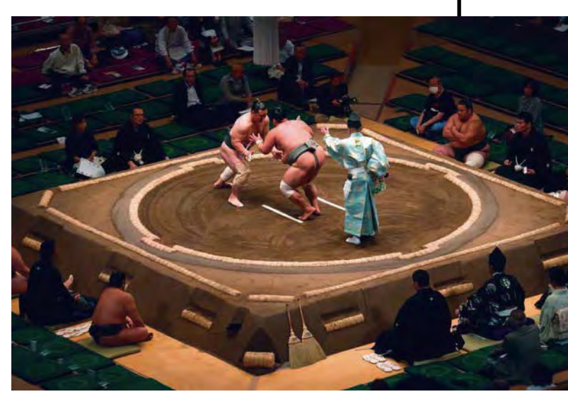
The ring is made of hard packed earth. The referee, or gyoji , oversees the bouts in his colorful traditional clothes.

then...repeat the whole sequence a few more times. We closely watch the referee's gunbai war fan, for when he holds it towards the front rather than to the side it means time is up and it's time to fight.