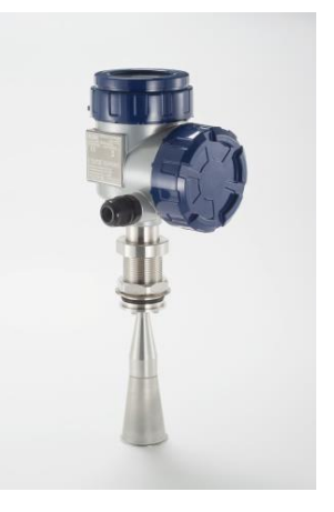
Radar level Gauge