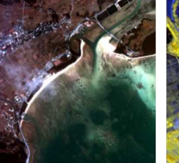
RGB3 bands + red edge band (Simulated image)

• 3D representation of underground facilities such as water pipes makes it possible to understand the status of underground facilities in 3D, rather than simple lines and surfaces.